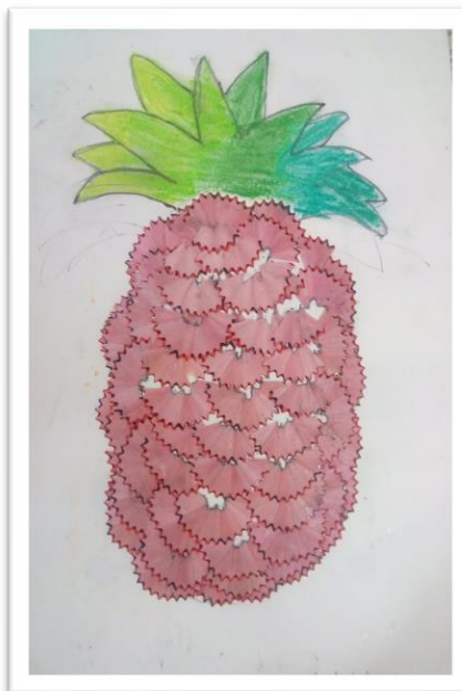
Anjali Tengale 2 nd D