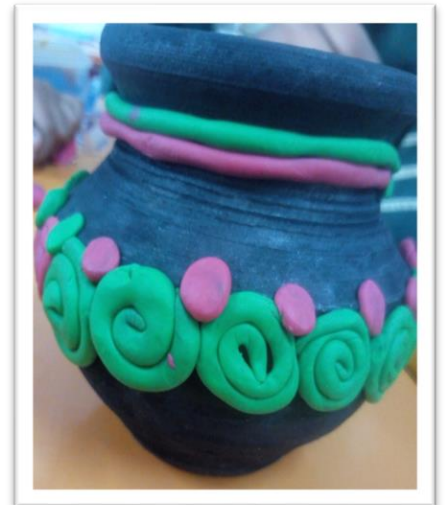
Adhira 2 nd C