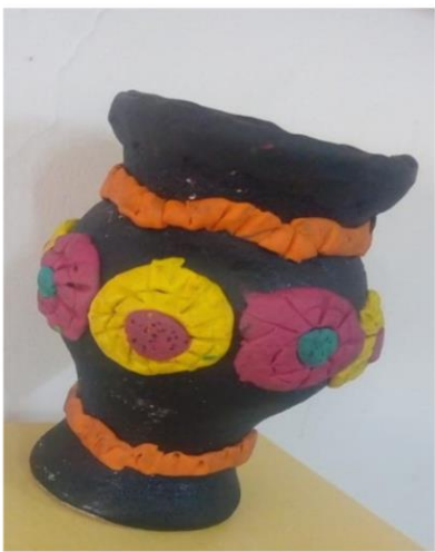
Aradhya Chippa 2 nd A